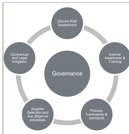
Figure 1 LSEG's approach to managing modern slavery risk

and can tackle, slavery related risks. It has determined the approach to risk assessing our supplier base for slavery risk.